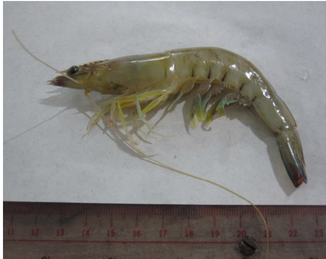
Plate 3. Penaeus latisulcatus .