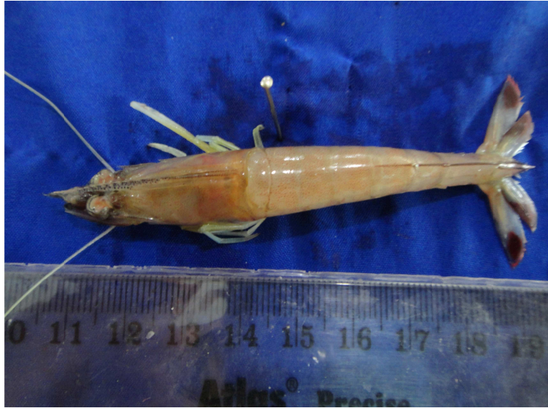
Plate 7. Metapenaeus dobsoni

Seven species ( Penaeus indicus , P. monodon , P. latisulcatus , P. semisulcatus , P. japonicus , Metapenaeus monoceros and Metapenaeus dobsoni ) were found in Kakkaiithivu Coastal Area during the present study. Out of the seven species recorded here, five species ( Penaeus indicus , P.monodon , P.latisulcatus , P.semisulcatus , and Metapenaeus monoceros ) have already been reported by Chitravadivelu and Arudpragasam (1983) in Jaffna estuary. The occurrence of P. japonicus and Metapenaeus dobsoni were recorded for the first time in Kakkaiithivu Coastal waters of Jaffna estuary.