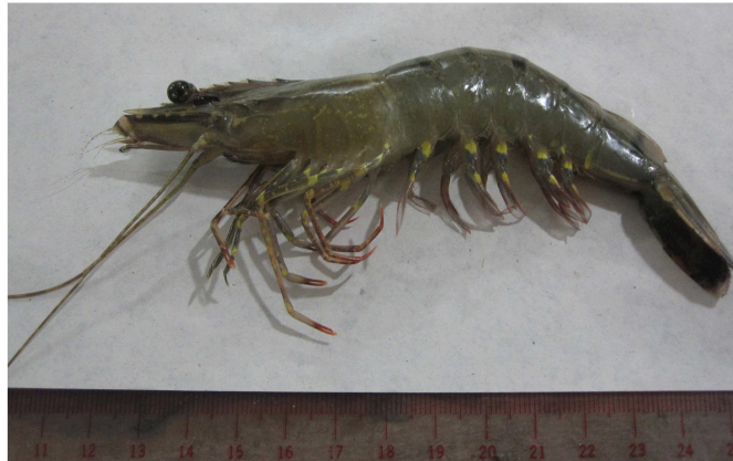
Plate 2. Penaeus monodon

A detailed photograph of P. monodon is given in Plate 2. The distinguishable characters of the species include greenish grey body with dark brown bars and pleopods with yellow spot. They carry uniform antenna ranging pink –brown colour.