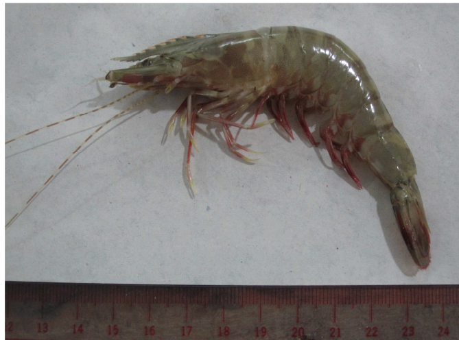
Plate 4. Penaeus semisulcatus

Plate 4 shows the unique features of reddish brown to pale brown body with brownish grey dorsal transverse bands, antenna banded white and brown colours and carapace without longitudinal sutures.