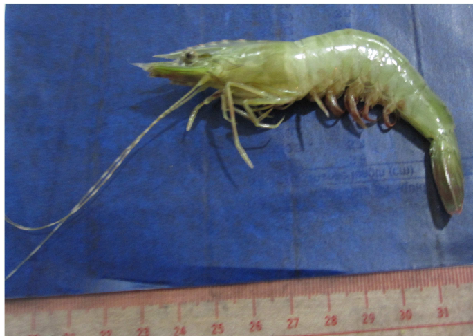
Plate 6. Metapenaeus monoceros

Plate 6 shows the details of M. monoceros , which carry Greenish grey body.