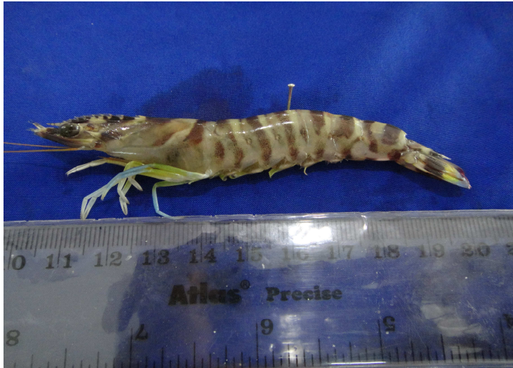
Plate 5. Penaeus japonicus