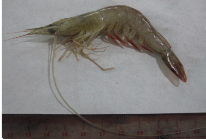
Plate 1. Penaeus indicus